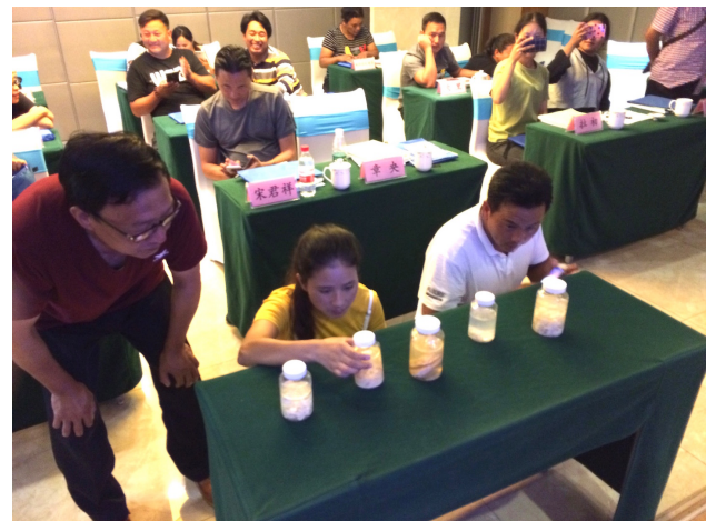
Trainees examining different species of tapeworms