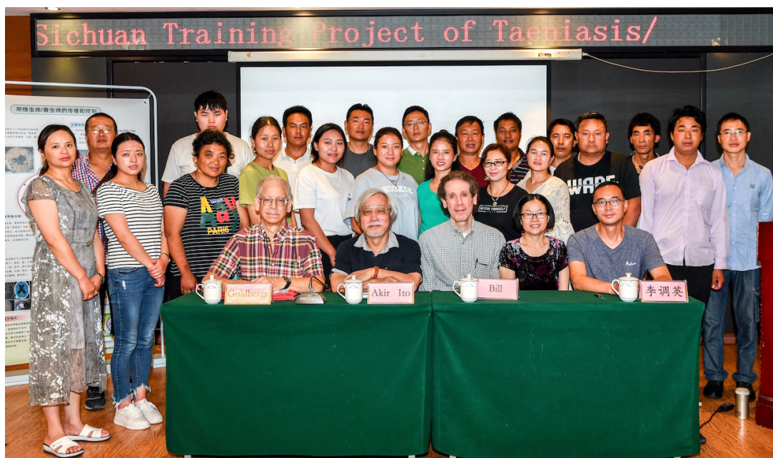
Trainers and trainees in Xichang, September 4